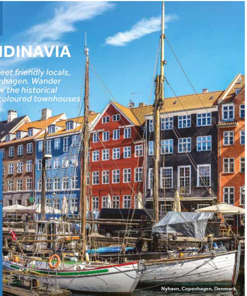
Nyhavn, Copenhagen, Denmark

Taste local treats at Helsinki's food market • Sparkling wine and caviar in North Cape.