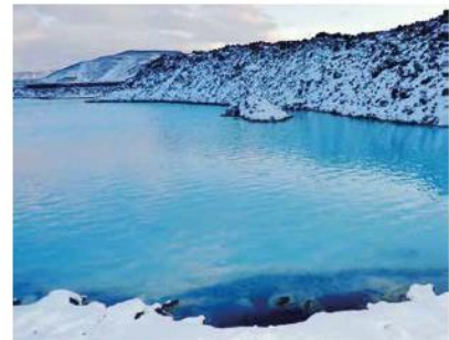
INSIGHT CHOICE | Spend time relaxing in the Blue Lagoon. (Day 6, Reykjavik)