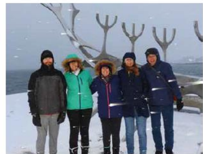
TOP RATED HIGHLIGHT | Join an enthralling city tour with your Local Expert. (Photo by @Dani.green21, Day 5, Reykjavik)