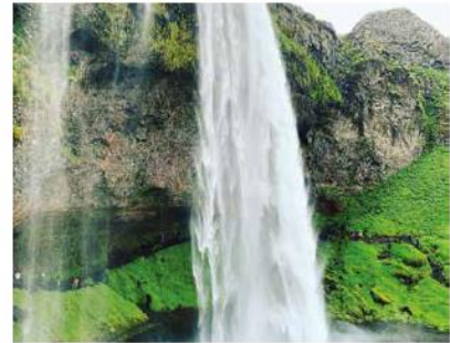
TOP RATED HIGHLIGHT | Witness to majesty of Seljalandsfoss waterfall. (Day 2, Seljalandsfoss)

Your Icelandic adventure comes to an end, with a transfer to Reykjavík's Keflavik Airport. (B)