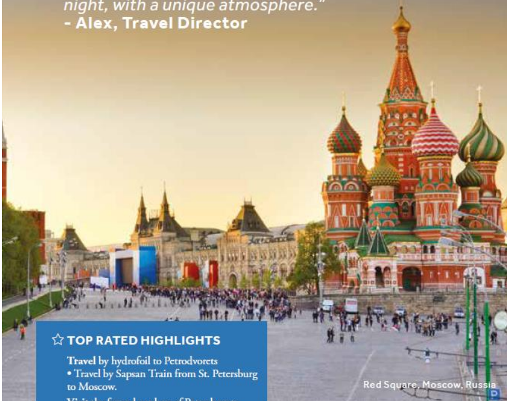
Red Square, Moscow, Russia