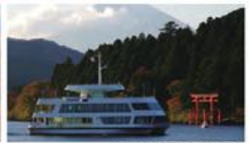
Lake Ashi Pleasure boat

Autumn colored leaves are at their best viewing time in late November.