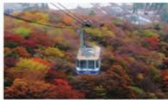
Mt. Komagatake Ropeway

Autumn colored leaves are at their best viewing time in late November.