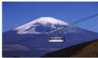
Mt. Komagatake Ropeway

Oshima cherry trees are at their best viewing time in late April.