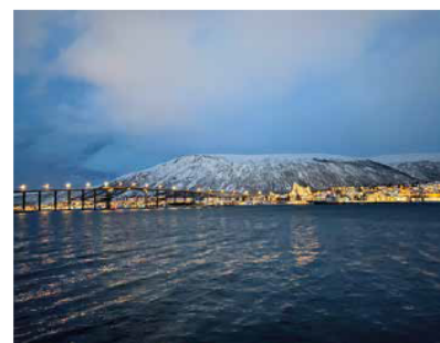
f TOP RATED HIGHLIGHT | Discover beautiful scenery in Tromsø with your Travel Director. (Day 7, Tromsø)