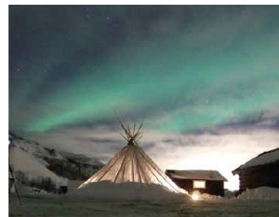
f TOP RATED HIGHLIGHT | Witness the wonder of the Aurora Borealis. (Day 2, Ivalo)

It's time to say farewell to your fellow travellers, as a transfer arrives at Oslo airport at 07:15 or 10:15. (B)