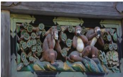
Three Wise Monkeys