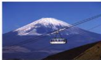
Mt. Komagatake Ropeway

Oshima cherry trees are at their best viewing time in late April.